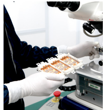
Power Module Assembly