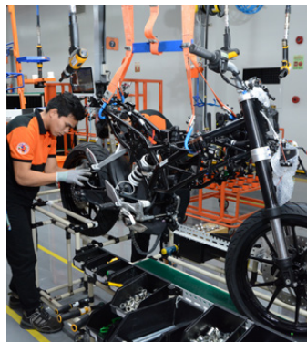
Motorcycle Manufacturing Assembly