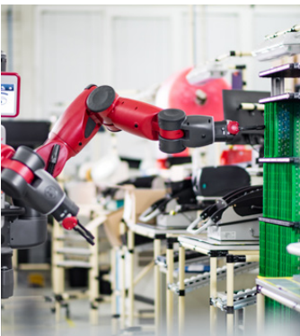
System Integration / Automation