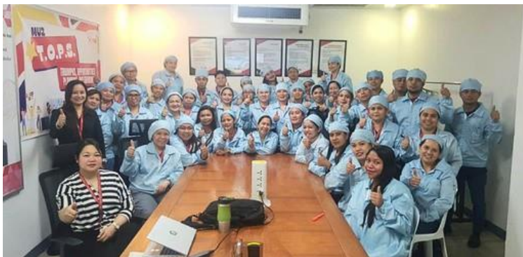
IMI COC refresher orientation conducted in Shared Vision room

IMI believes that open communication and direct engagement between employees and management are the most effective ways to resolve workplace issues.