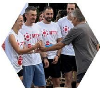
Concern for Others