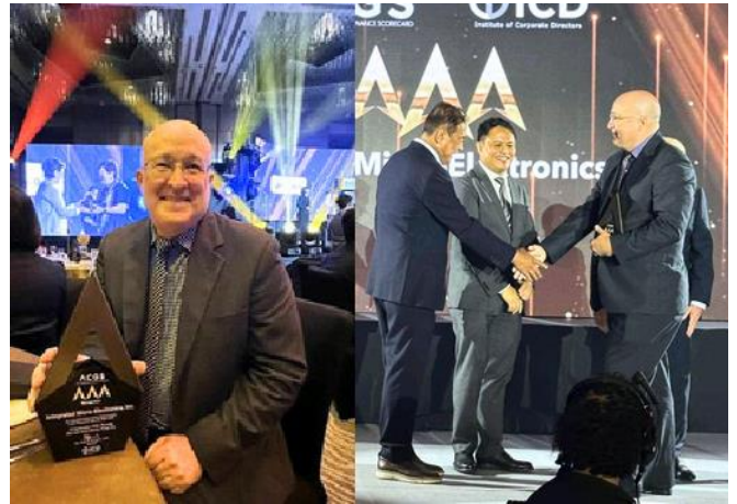
IMI PH awarded with three distinguished Golden Arrow awards from the Institute of Corporate Directors (ICD)

However, if the gift does not fall under any of the above-mentioned conditions, employees should report to the Chief Human Resource Officer or Ethics Officer all gift items received, in cash or in kind for proper disposition