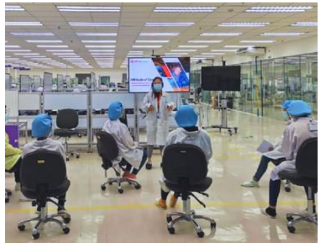
IMI COC refresher orientation conducted to IMI PH Employees

There are processes for communicating clear and accurate information about IMI's policies, practices, expectations and performance to employees, suppliers, and customers. The approved IMI Code of Conduct Policy is distributed to all employees for awareness thru email blast, HR Intercom, New Hire Onboarding Program and Corporate websites.