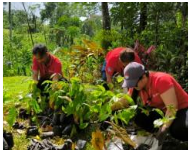
IMI PH Tree Planting in Cavinti, Laguna

All required environmental permits (e.g., discharge monitoring), approvals and registrations are to be obtained, maintained, and kept current and their operational and reporting requirements are to be followed.