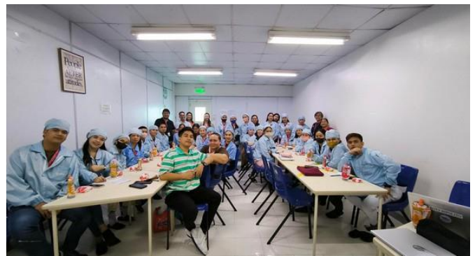
IMI PH's Usapang Pamilya held at SSCG training room