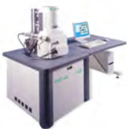
Scanning Electron Microscope (SEM) with Energy Dispersive Spectroscopy (EDS) EVO40 maximum magnification: 1,000,000x