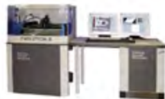
Scanning Acoustic Microscope (SAM) Evolution II transducers: 20 MHz, 30 MHz, 50 MHz, 75 MHz, 110 MHz