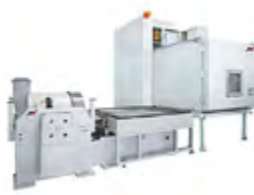
Vibration Testing Room