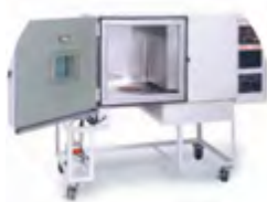
High or Low Temperature Storage Test Chamber Tenney BTC: -73°C to 200°C Enviro Oven MO384: 30°C to 300 °C