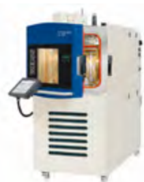
Temperature Shock Test Chamber Weiss TS-120 -80°C to 220°C