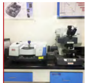
Nicolet iS50 Fourier Transform Infrared Spectrometer (FTIR) Spectral Range: 350-7800 1/cm-1