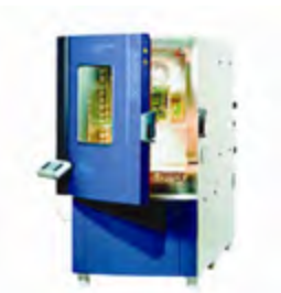
Temperature Humidity Test Chamber Weiss WK340 -45°C to 180°C 10% to 98% RH