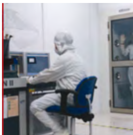
Class 10K Cleanroom